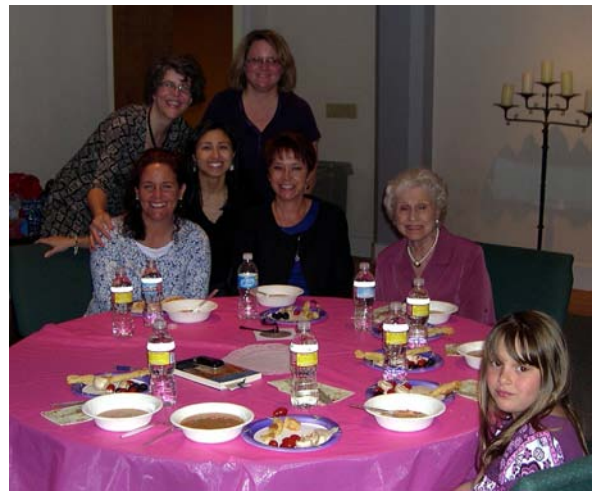
"Join the fun of teaching children's Sunday School!"

"Our language is ambiguous in its use of words like 'wrong' and 'shortcomings,' all of which can be used in a wide range of circumstances ranging from deliberate offenses to honest errors to simple incapacity. ...An easy conflation of mistakes and sins can bind heavy burdens on children's shoulders. Children are clumsy, impulsive, inexperienced, and weak. They 'get things wrong' with great regularity, and are constantly being asked by adults to apologize for things that turned out