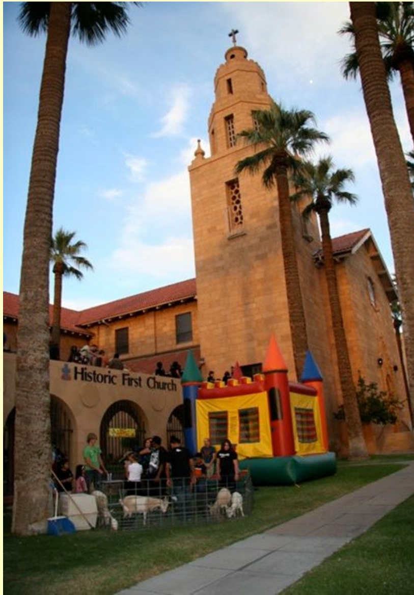
2010 Fall Festival

A publication of the activities and ministries of Historic First Presbyterian Church October 2011